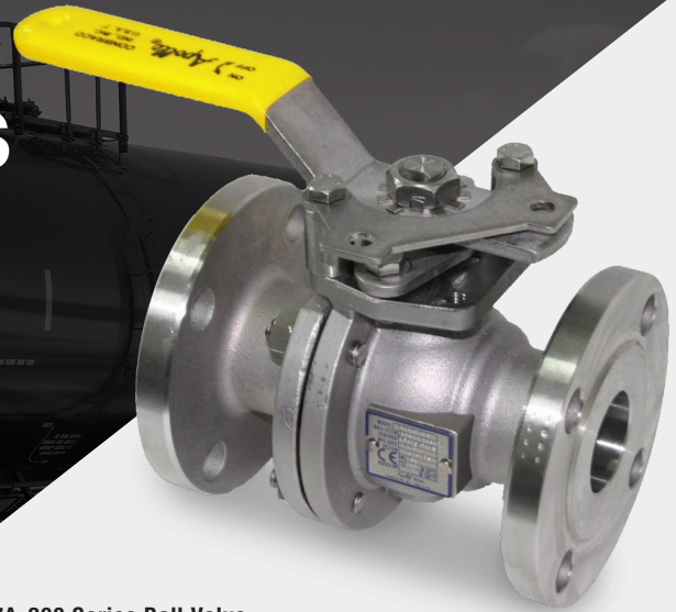
87A-200 Series Ball Valve