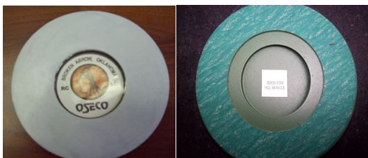
Figure 1. 4.75" Rupture Discs - Oseco and Zook