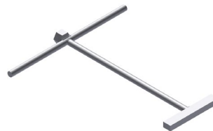
Figure 2. Quick Inspect Wrench