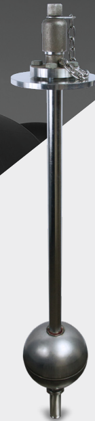
Magnetic Gauging Device Part Number: MGD1000