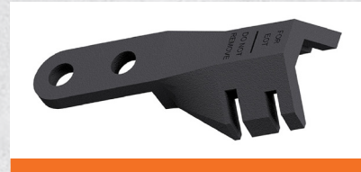
Bracket for alternate EOT attachment