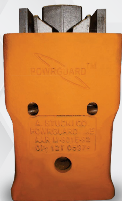
A. Stucki Company PowRGuard™ XE & GX