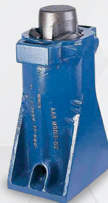
Miner TF 800