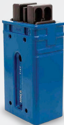
Miner Crown SE