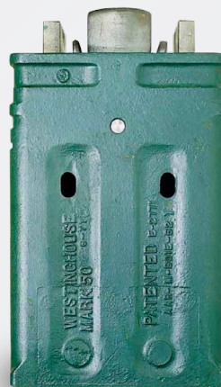
Cardwell Westinghouse Mark 50 & R500