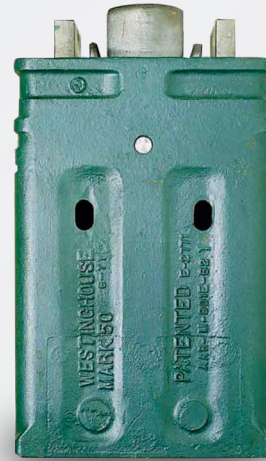
Cardwell Westinghouse Mark 50 & R500