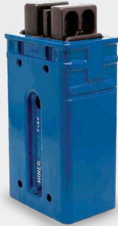
Miner Crown SE