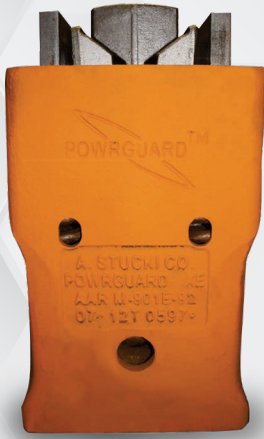
Independent Draft Gear PowRGuard™ XE & GX