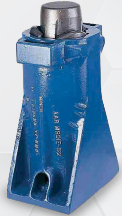
Miner TF 800