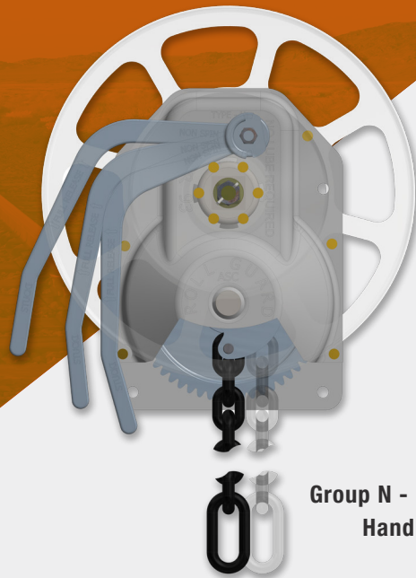
Group N - RollGuard™ Hand Brake

The clutch is also composed of wide diameter bearings that extend life and fatigue resistance. All of which ensures a safer ride for your crews and cargo.