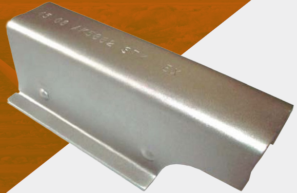
Part Number: ASC-1696