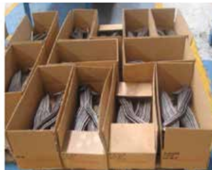
Standard Packing 100 pieces per box, 10 boxes per pallet