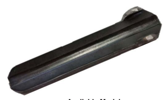
Available Models: 3/4" - 7/8" - 1 1/8"