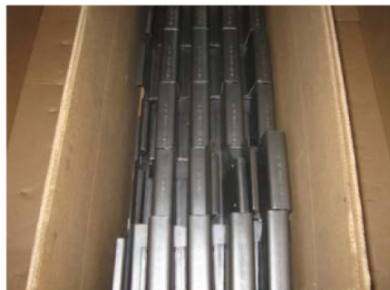
Standard Packing 100 pieces per box, 10 boxes per pallet