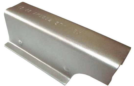
Part No. : ASC-1696