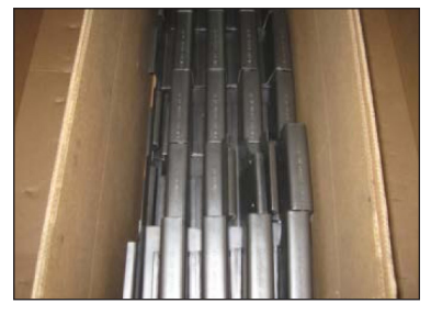
Standard Packing 100 pieces per box, 10 boxes per pallet